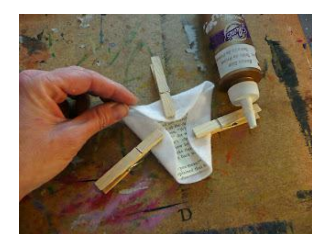
7.) Place a little bit of glue into the open corner and add a feather.