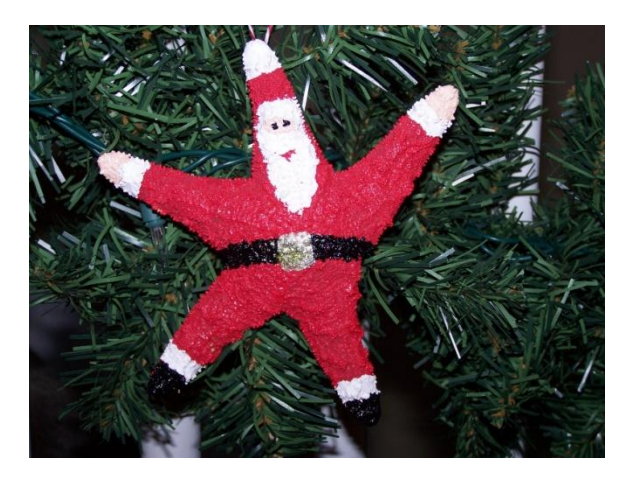
PS....Starfish are VERY fragile so when you store them, wrap each ornament individually in tissue, then put them in a box within the big box of ornaments.