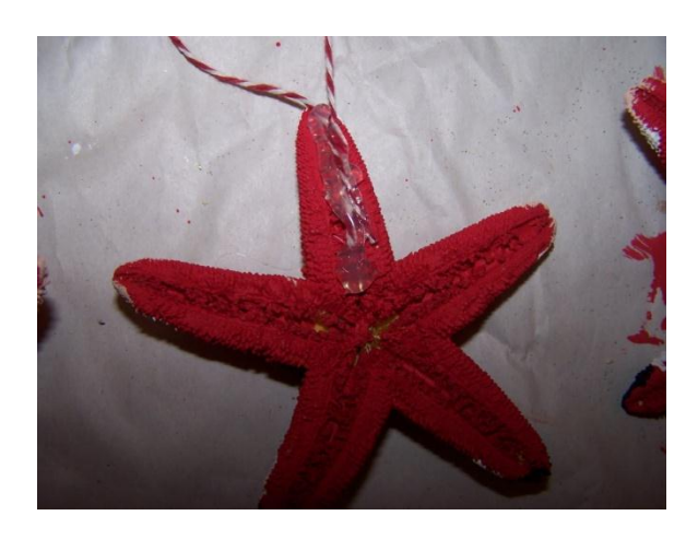
While the glue is still very warm, carefully press it down into the grooves...careful not to burn yourself though.