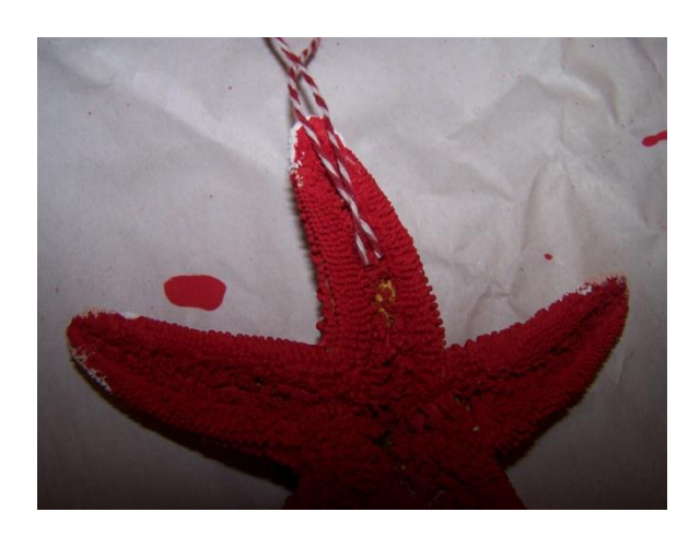
8.) Then glob on some hot glue.

Put your thread together and lay it in the natural crevice along the limb. Don't put a knot in it, the crevice isn't that accommodating because of the bumpiness of the spines.