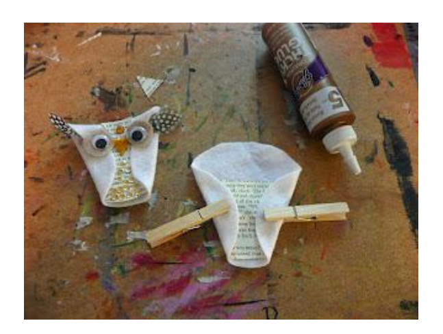
6.) Put a dab of glue at the top of your flower pot shape and fold the felt down. You want to keep the ends open.