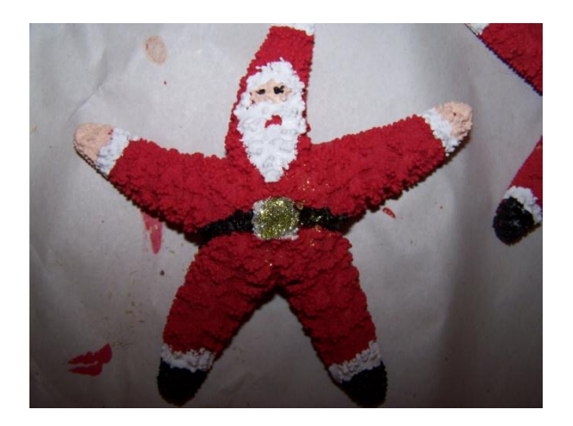
6.) Spray with clear gloss and let dry. (optional)

From this angle Santa looks unhappy...but he isn't, just an illusion because of the bumps...no worries!