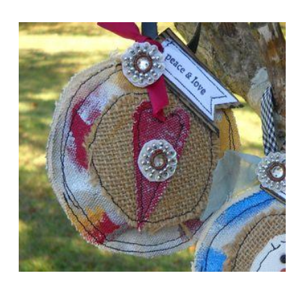
**Jacquard Lumiere and Neopaque can be purchased from Dick Blick Art Materials.