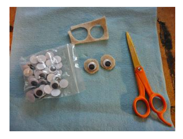
10.) Glue into place on the owl.

9.) Cut 2 circles from the tan felt that are larger than your googly eyes.