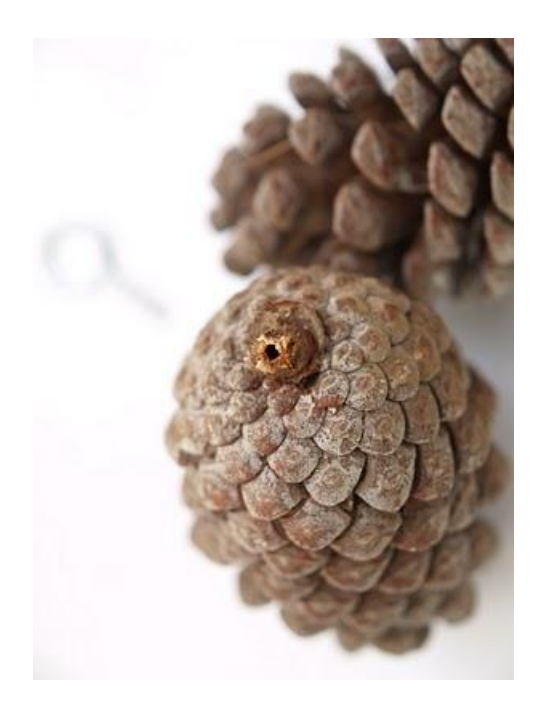
3.) Screw the eye hook into the hole.

2.) While the beeswax is melting, drill a hole, just a little but smaller than the width of your eye hooks, in the top of the pine cone.