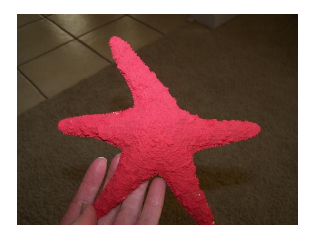
Or jumping and dancing?

Now...here is the fun part! Hold your starfish up and look at the limbs. Figure out what this Santa will do. Will he be swaying to Christmas music?