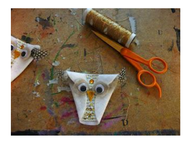
14.) If you want you can gently fold it in a bit to add a little shape so it isn't so flat.