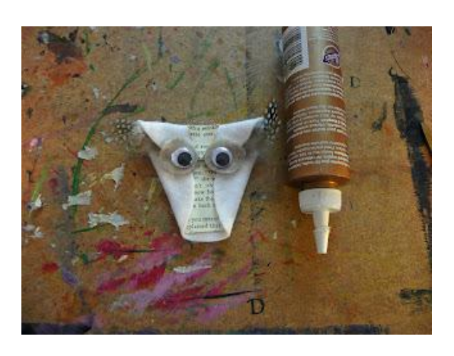
11.) Cut a little beak triangle from the gold felt and glue into place.