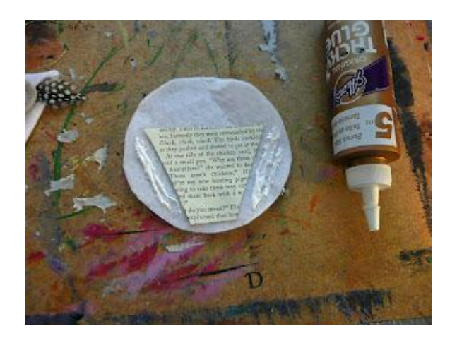
5.) Fold the felt over and hold for a few seconds while the glue sets up. You can use some clothespins to help you out.

Put some glue on the felt on either side of the shape.