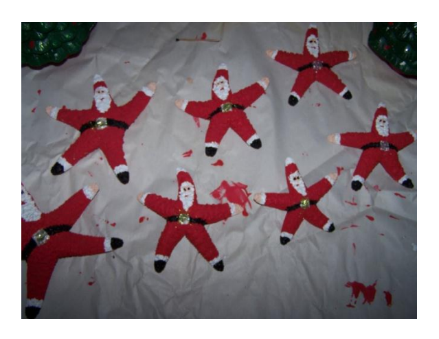
7.) Now, flip Santa over and give him a spanking glue your thread to hang him by.

Put your thread together and lay it in the natural crevice along the limb. Don't put a knot in it, the crevice isn't that accommodating because of the bumpiness of the spines.