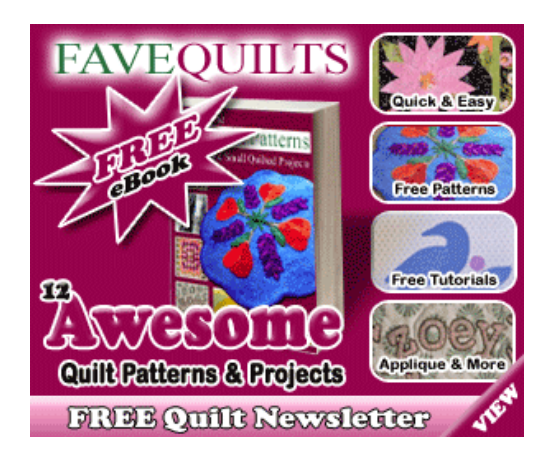
12 Awesome Quilt Patterns & Projects